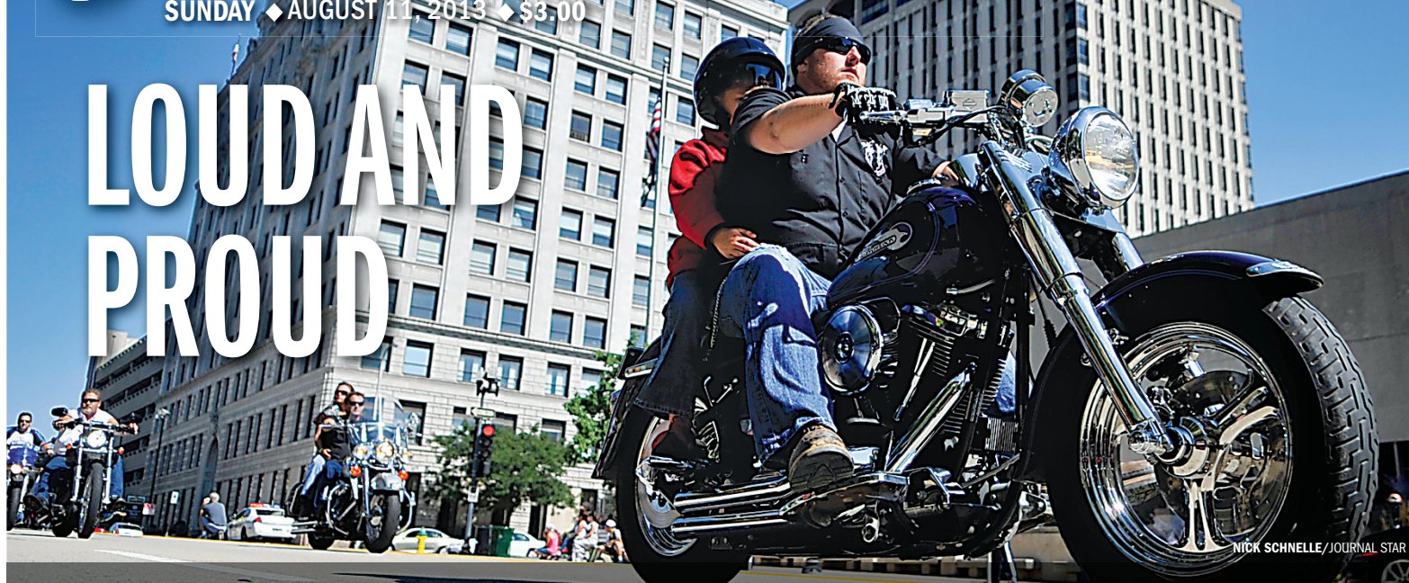
MOTORCYCLISTS DESCEND ON RIVERFRONT FOR GRAND NATIONALS WEEKEND. B1, D1